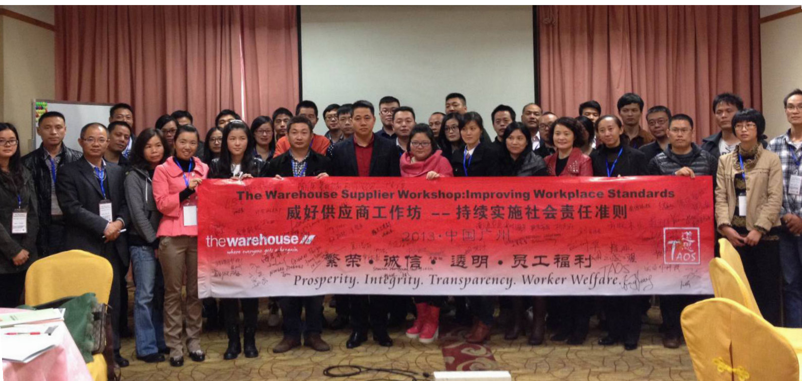
Attendees at a recent supplier workshop in Guangzhou.

We are proud to see our efforts to meet customer needs here in New Zealand also contributing to the income and welfare of citizens in developing countries. There is more to do and The Warehouse is committed to working with its trading and service partners to effective positive change in every environment in which we operate.