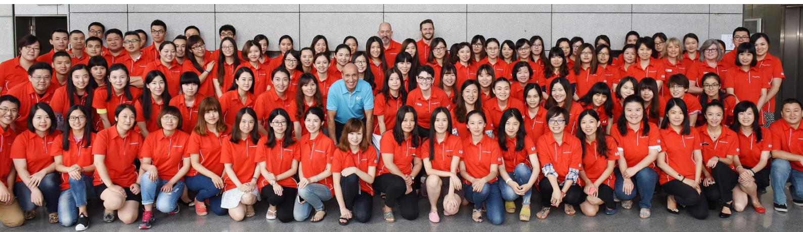
Below: Team members from our Shanghai office along with our New Zealand based sourcing executives.

While most merchandise at The Warehouse is imported, New Zealand made products are the second-biggest single source. Local importers and agents also capture margins on all products that are not directly imported by The Warehouse.