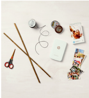
PHOTO WALL HANGER